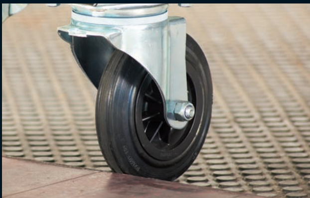
Easy handling of the unit due to big and robust swivel and carrier wheels.