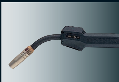
SB 157 G mixed gas: 150 A 60% duty cycle CO 2 : 180 A 60% duty cycle