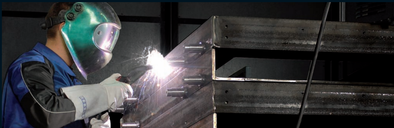
RedMIG 3000 K