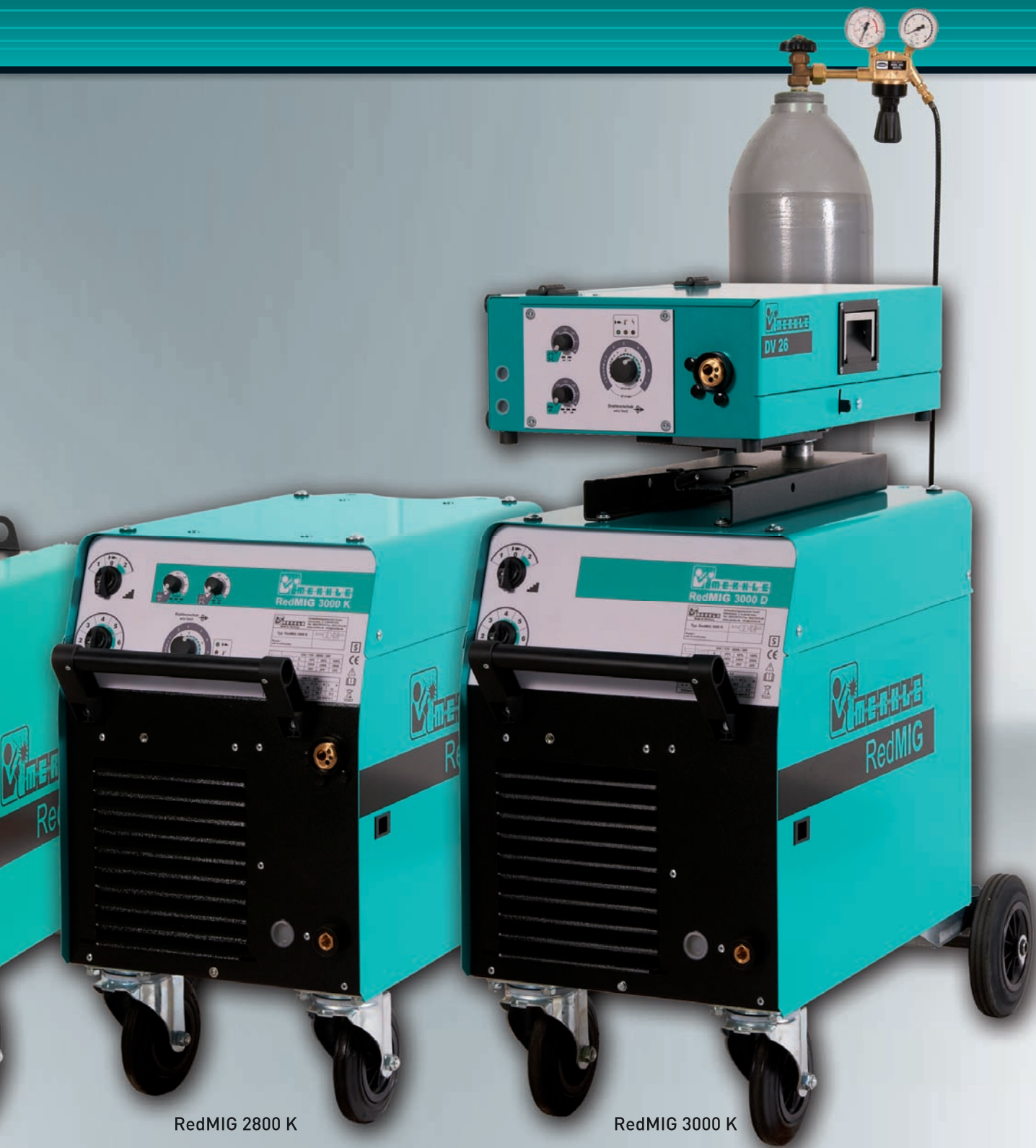
RedMIG 2800 K