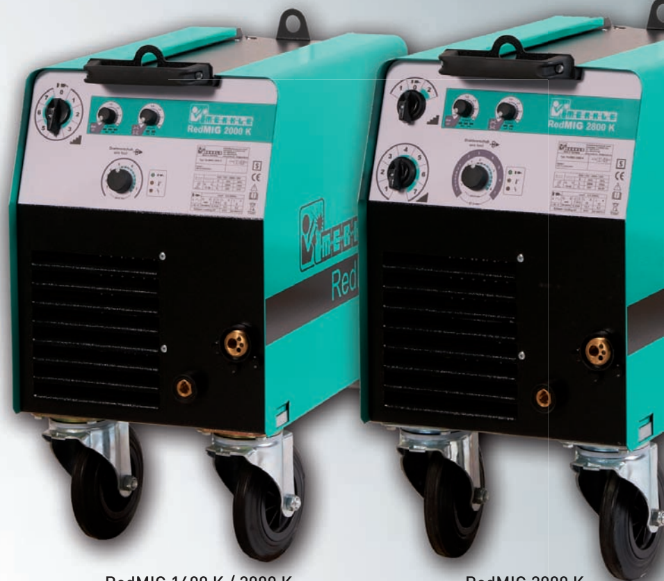
RedMIG 1600 K / 2000 K